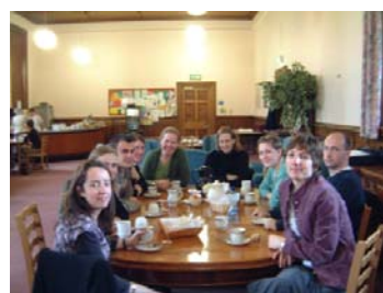
Students, staff and presenters at the Global Dimension Conference