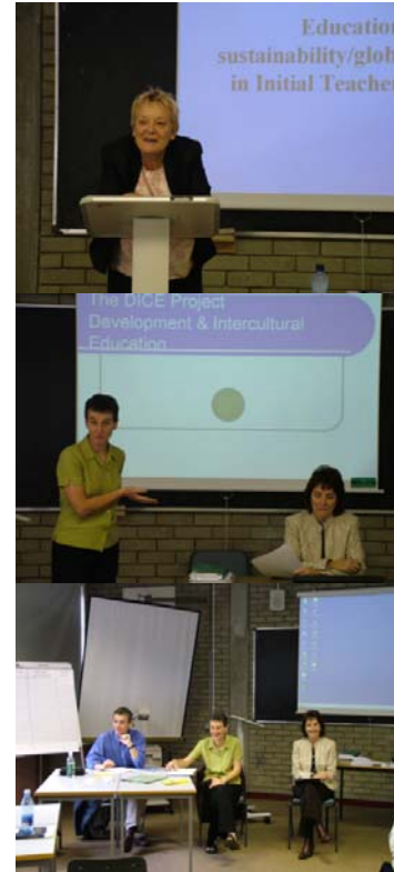
Some of the presenters