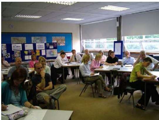
Members of staff who attended the staff training day