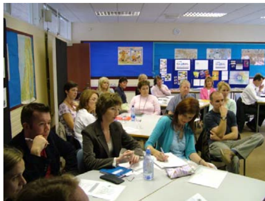
Members of staff who attended the staff training day