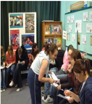
BEd students in the Resource Office