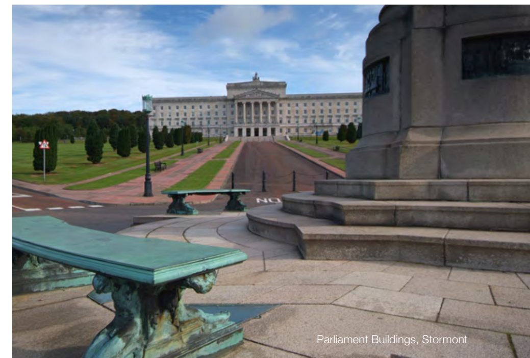
Parliament Buildings, Stormont