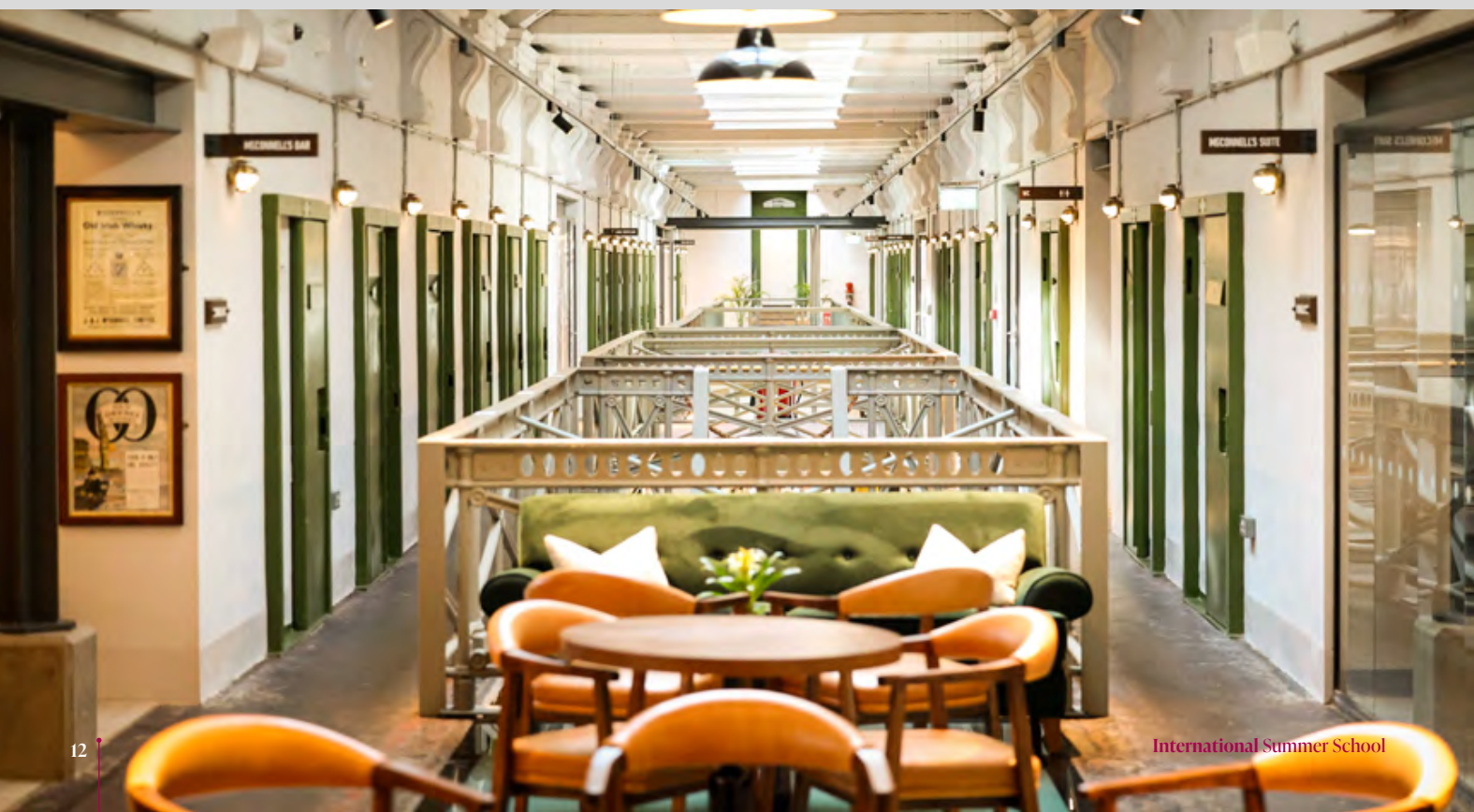
International Summer School