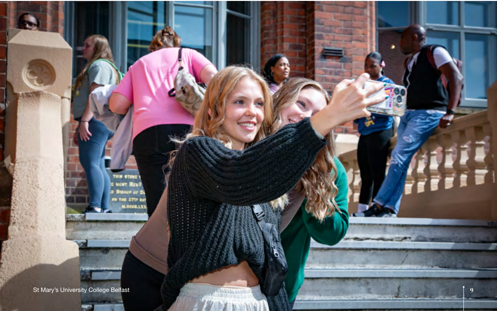
St Mary's University College Belfast

When one realises the game is rigged and always has been. When one sees through the corruption, the lies, the deceit, the hypocrisy of all wars, of big pharma, the