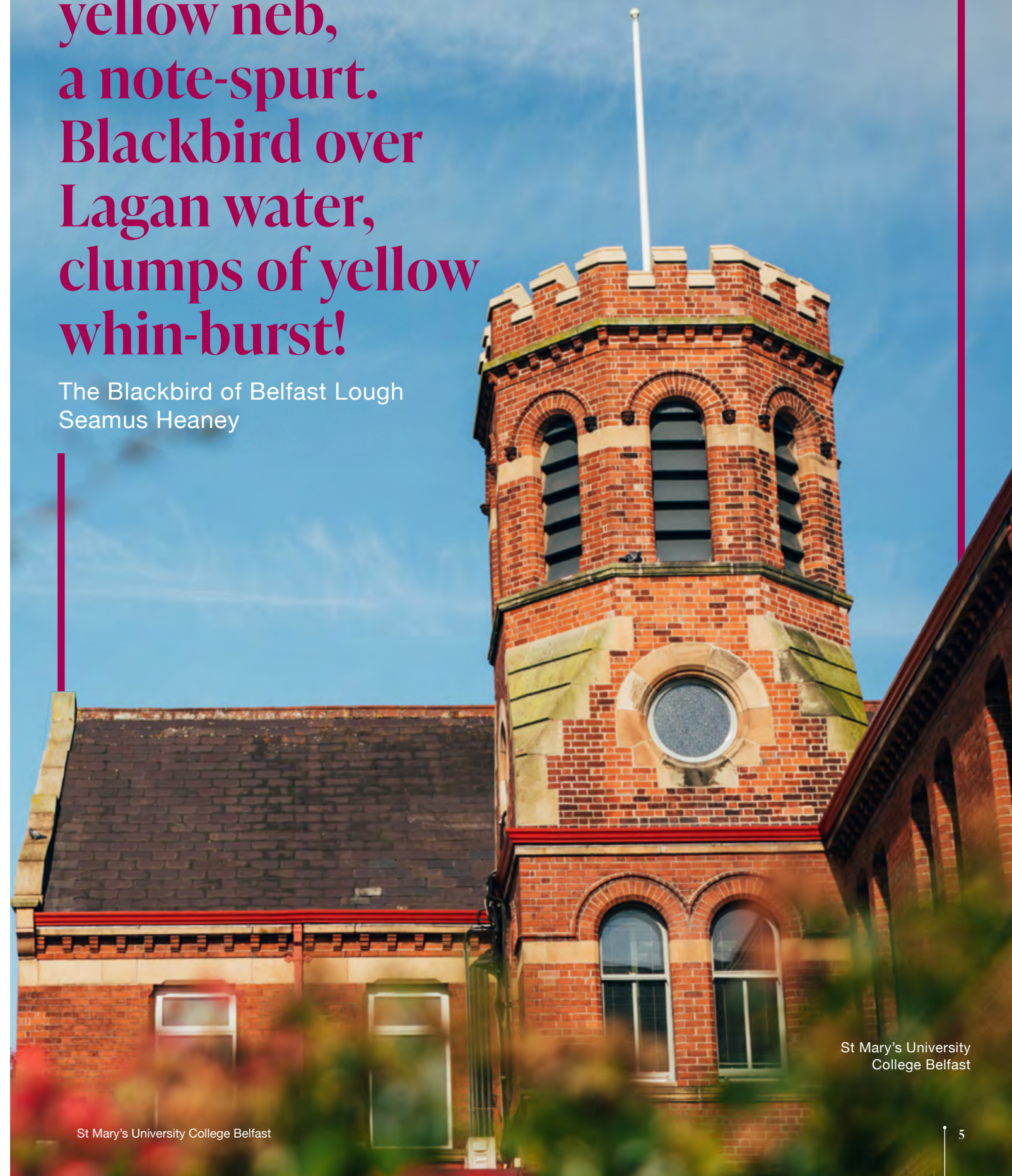
St Mary's University College Belfast

The Blackbird of Belfast Lough Seamus Heaney