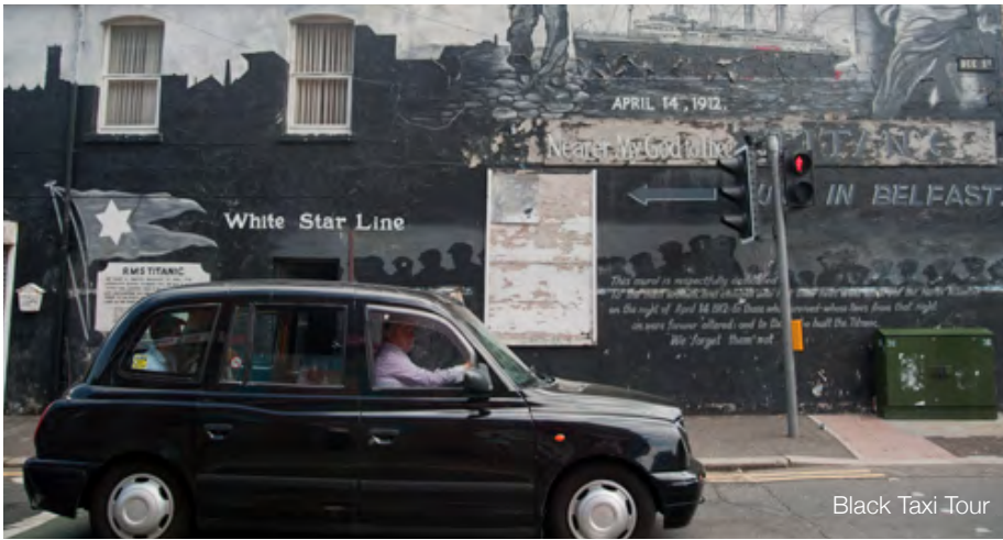
Black Taxi Tour

Falls Community Council’s annual round- table event brings women from all communities together to discuss how working in solidarity, we can further women’s rights and build a peaceful society for our children and grandchildren. Stormont is back, and women are in charge! But how do we ensure grassroots women have a voice in the debate?