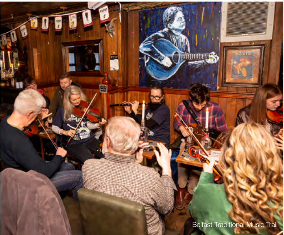
Belfast Traditional Music Trail