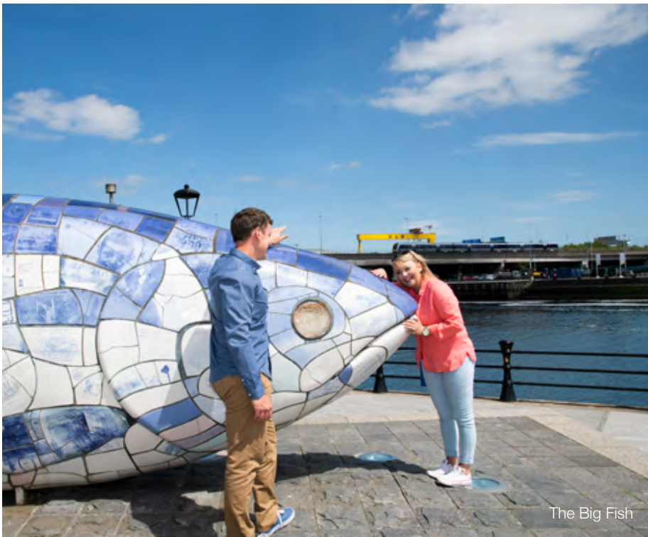
The Big Fish