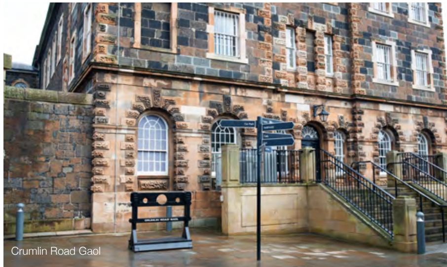
Crumlin Road Gaol

The small bird chirp-chirruped: yellow neb, a note-spurt. Blackbird over Lagan water, clumps of yellow whin-burst!