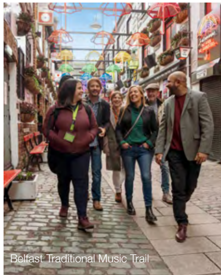
Belfast Traditional Music Trail