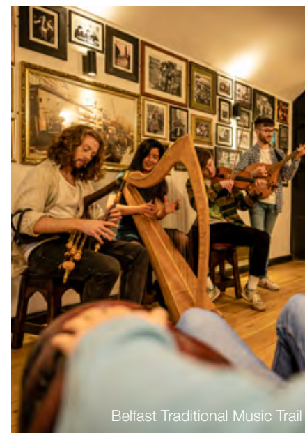
Belfast Traditional Music Trail