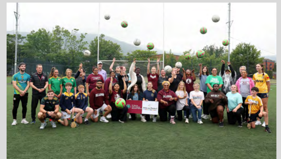
St Mary's University College Belfast

There are six different games in the family of Gaelic Games. These are Hurling, Gaelic football, Handball, Rounders, Camogie and Ladies Football. Your taster session will focus on an introduction to the basic skills of Gaelic football and hurling/camogie.