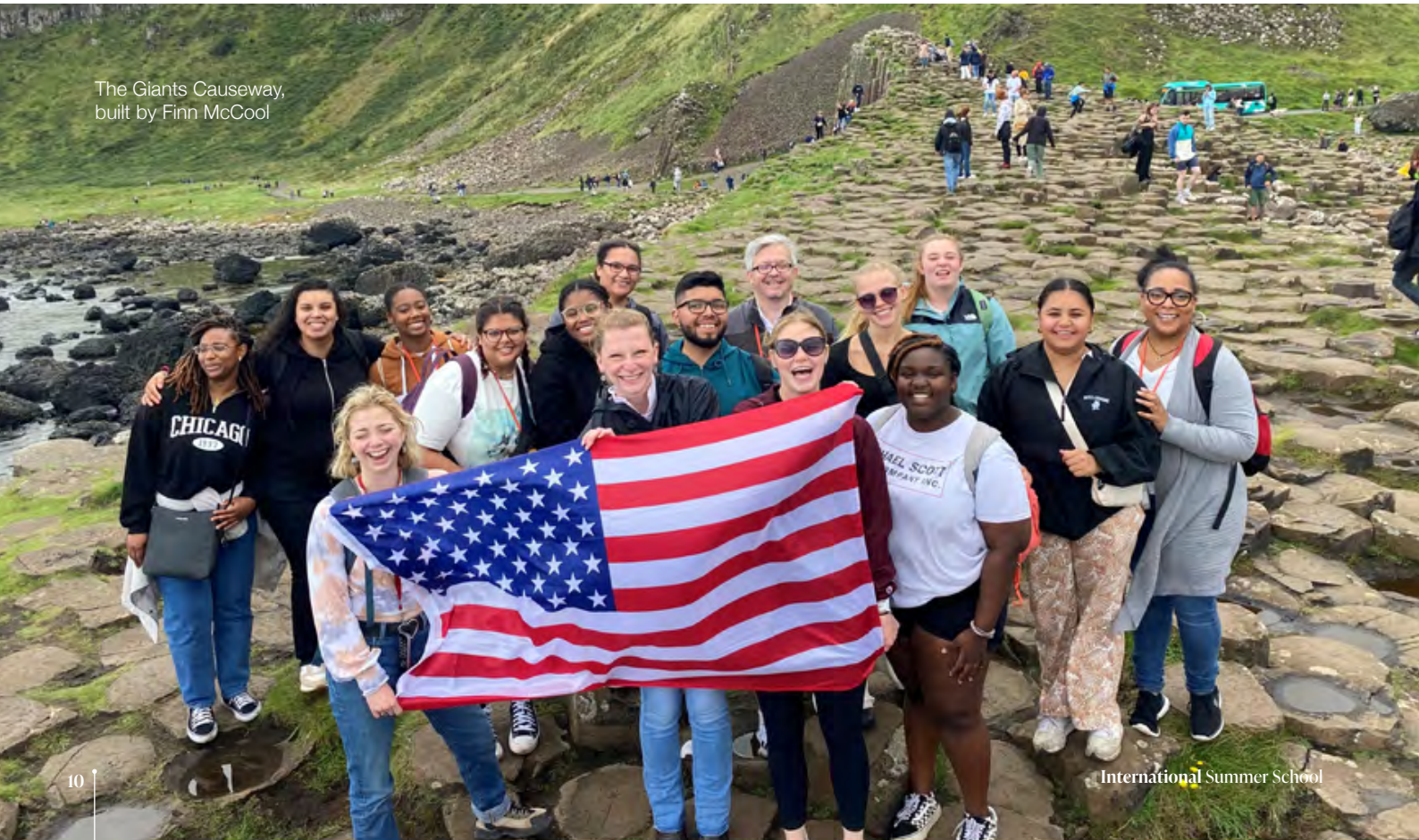
The Giants Causeway, built by Finn McCool