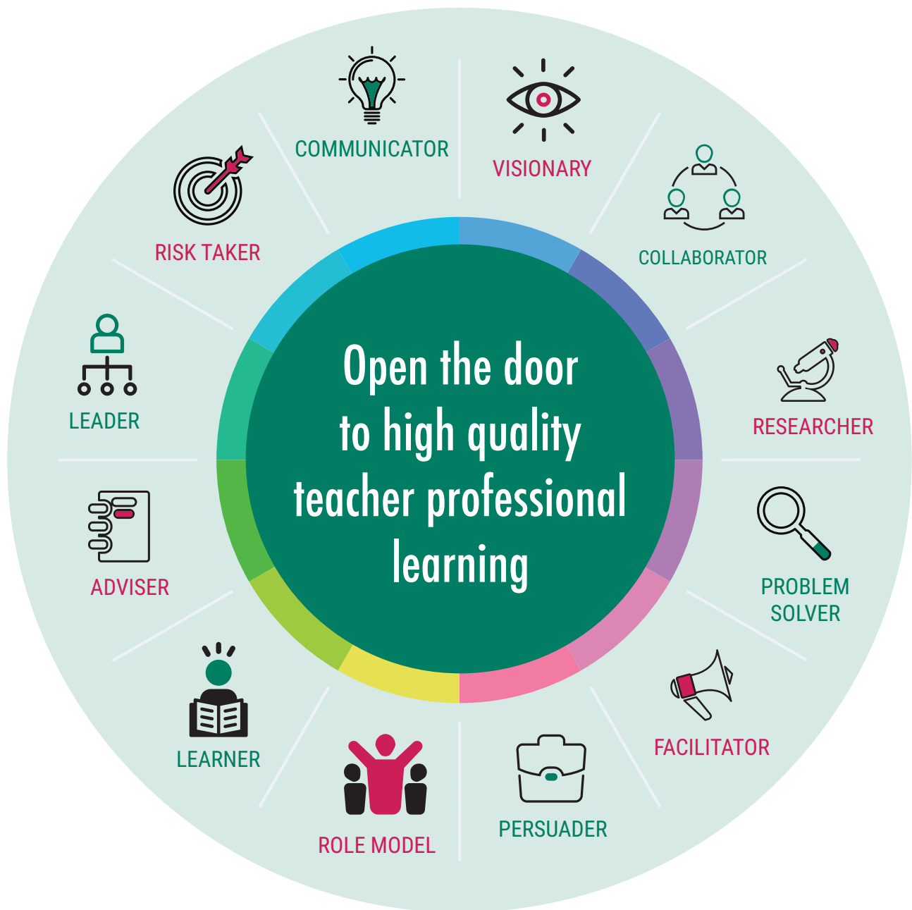
Figure 1: Build on your Strengths as a Teacher Adapted from, Department of Education for Northern Ireland (DENI) (2017) Learning Leaders: A Strategy for Teacher Professional Development , Belfast, DENI.